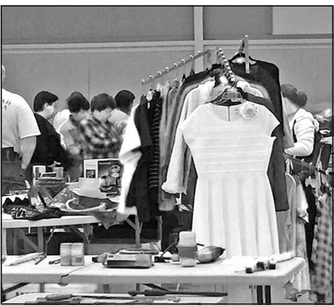
Union General Hospital sponsored this Relay For Life Yard Sale at the Blairsville Civic Center on Saturday, Feb. 18.