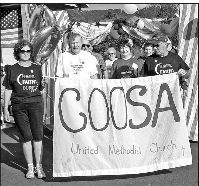
Relay For Life circa 2013, with a team from Coosa United Methodist Church.